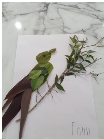
Flynn - Kinder