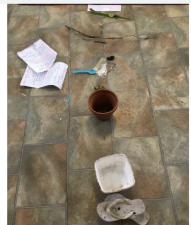
Byron - Year 1